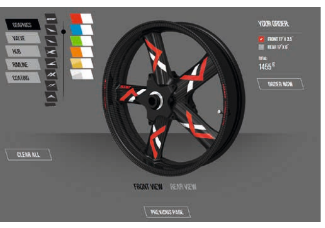
STEP 2: Choose your design.